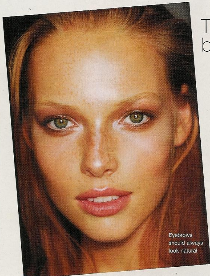
Eyebrows should always look natural